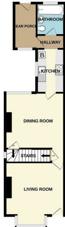
GROUND FLOOR 542 sq.ft. (50.3 sq.m.) approx.